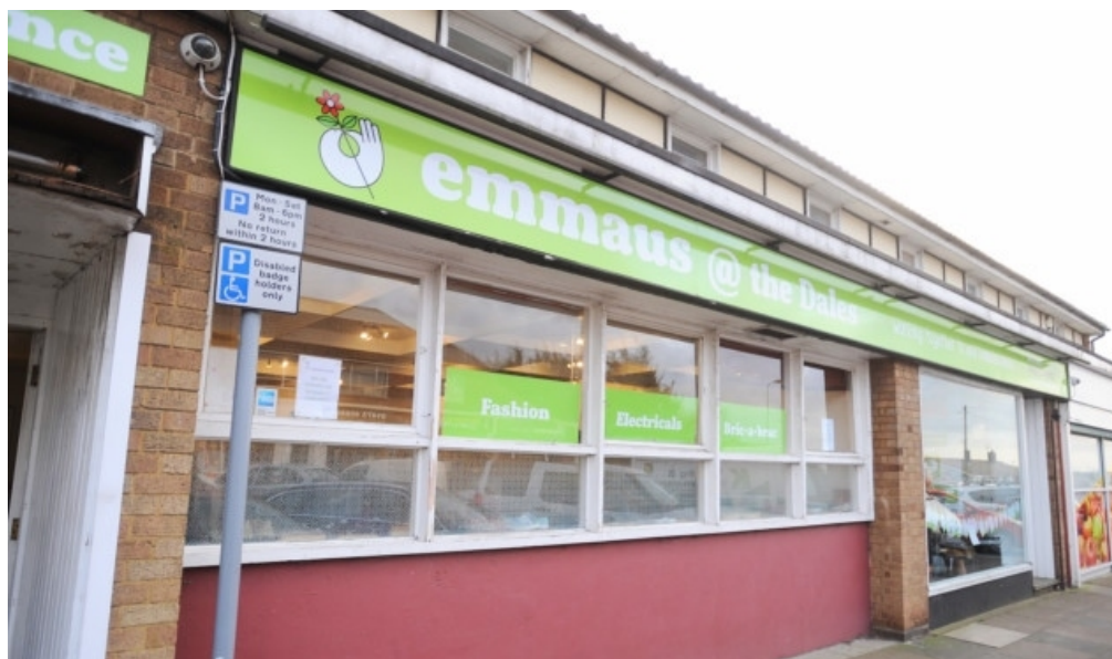
Figure 1 – Emmaus @ the Dales, on Dales Road, Ipswich